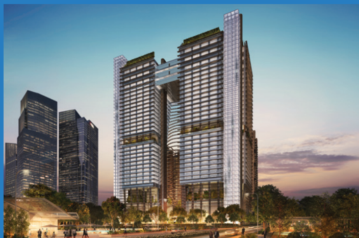
Marina One East Office Tower is now complete and open for business

Meanwhile, Marina One Residences is expected to complete in Q4 2017, when residents can begin enjoying luxury living in Marina Bay.