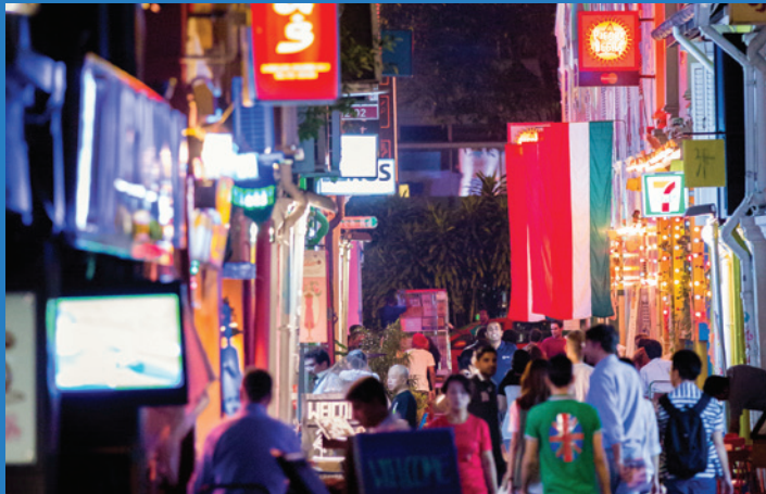
Bugis/Kampung Glam area in the present day

Once home to a large winding canal, the area now called Bugis Street – named after the Bugis people from Indonesia who came here to trade with local merchants – has evolved in character by leaps and bounds, yet has always bustled with vibrancy and life.