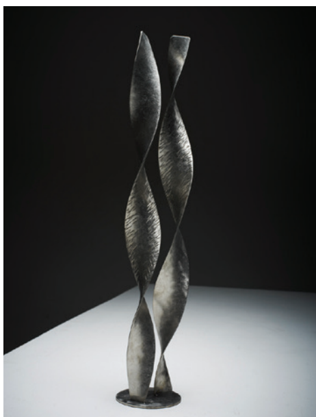
'Petai Symphony' by Sun-Yu-Li

Walk past DUO at the junction of Rochor Road and North Bridge Road, and your eye will undoubtedly be drawn by the captivating sight of a gracefully curvaceous sculpture rising from the ground and piercing through the ceiling to the floor above.