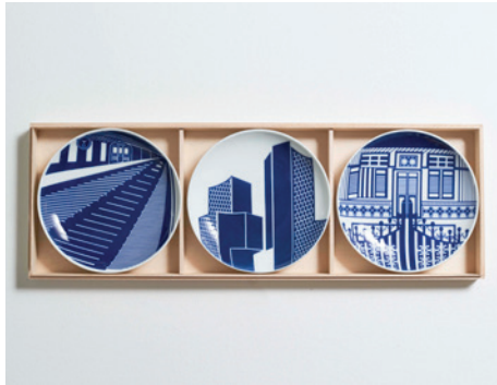
Supermama ceramic plate set - an exclusive welcome gift

Having obtained TOP, DUO Residences is ready to welcome residents when they move in with an exceptional lifestyle in the heart of the revitalised Ophir-Rochor area. The perks of life in this new beacon of luxury living are plenty, including, for starters, an exclusive set of Supermama brand ceramic plates given to every household as a special welcome gift.