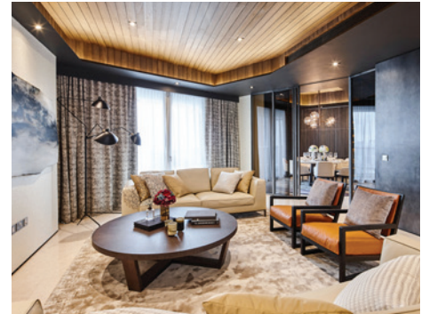
The quintessence of elegant luxury living

When in the mood for some retail therapy or a delicious bite to eat, all the retail and dining options located within DUO's integrated