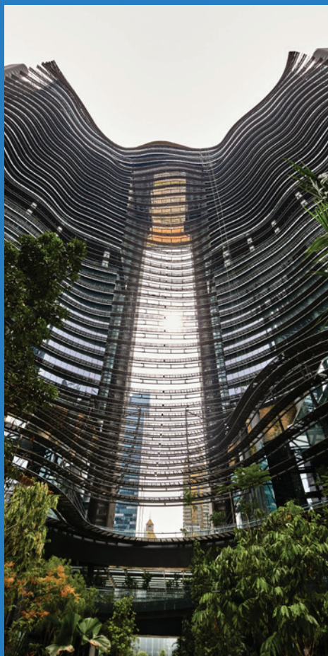
View from within the Green Heart